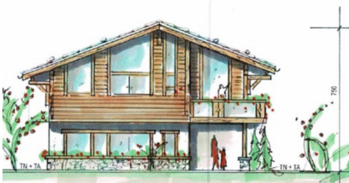
Façade Sud du chalet à construire 1 : 100